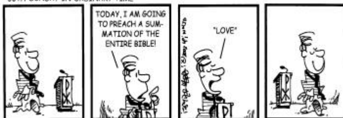
30TH SUNDAY IN ORDINARY TIME

Pumpkins will be available after each Mass this weekend on Oct. 24-25 for free-will donations. All proceeds are used to fund Pro-Life billboards in the St. Cloud area.