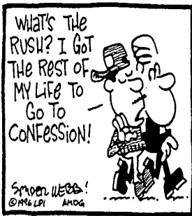
25 TH SUNDAY IN ORDINARY TIME

The COVID Food Assistance Program through Second Harvest Heartland is open to all households that are in need! Each household will receive 1 box of produce, 1 box of mixed dairy and 1 box of meat (chicken and pork). The next distribution date is September 21 from 11 am-1 pm (or while boxes last) in the CARE parking lot, 321 6 th Ave, Foley, MN. You will stay in your vehicle.